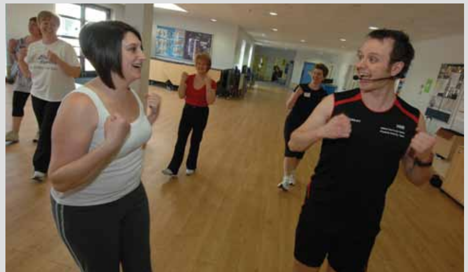
Photo: One of the fitness classes in full swing.

More details on community fitness classes are available on 01922 444044.