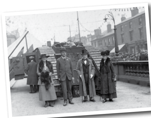
Julian the tank outside Walsall Town Hall in March 1918.