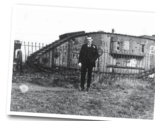
Julian the tank in Reedswood Park.